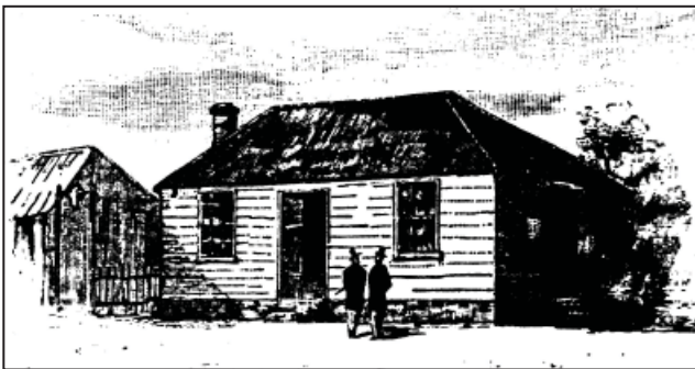
Early Melbourne Police Office

The Court was transferred from the Police Office near Spencer Street to a turf and sod hut, roofed with bark, which stood on the south-western corner of the Western Market Square. The Court sat in this building until the beginning of 1839 when it was again transferred to a wooden building which had been moved to the Market Square from William Street. When the Court of Quarter Sessions sat here, the Court of Petty Sessions sat in a brick cottage at the intersection of King and Bourke Streets.